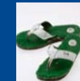
Thongs /Casual Sandals