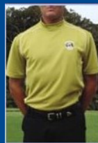
Mock Turtle Neck