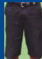
Knee Length Tailored

In addition to the above, well maintained denim is permitted except when an event with a dress code is hosted.