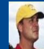
No cap or hat