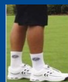
Sport - Golf Shoe