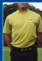
Mock Turtle Neck