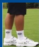
Sport - Golf Shoe